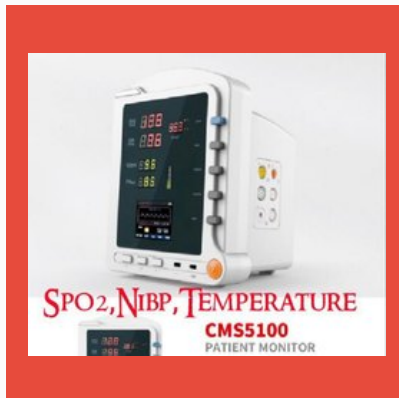
Contec Cms 5100 Monitor