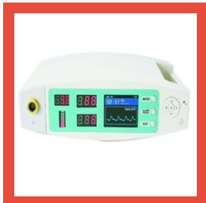
Tabletop Pulse Oximeter