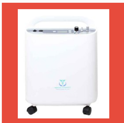
Nareena Oxygen Concentrator 5 LPM