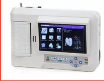
Digital Six Channel ECG Machine