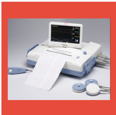
BT-350 Fetal Monitor