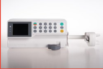
MDK SYRINGE PUMP