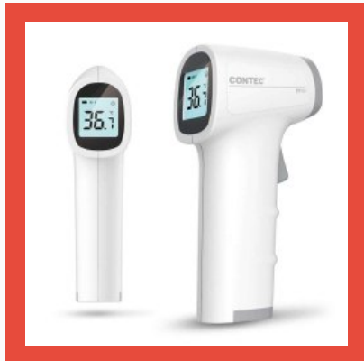
Non Contact Infrared Thermometer