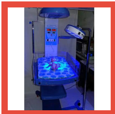
Baby Phototherapy Machine