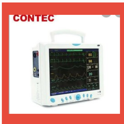
CONTEC CMS 9000 MULTIPARA MONITOR