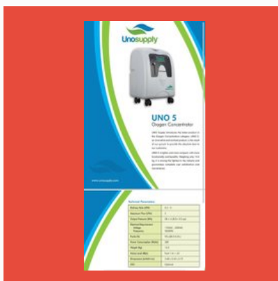
NIDEK OXYGEN CONCENTRATOR UNO5