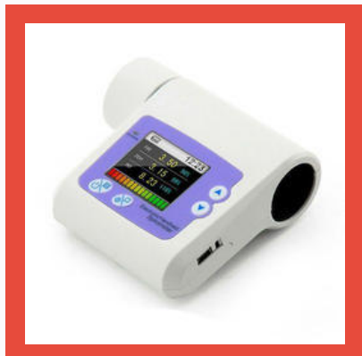
Contec SP10 Hand-held Spirometer