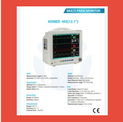
Cardiac Multipara Monitor