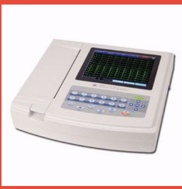
12 Channel ECG Machine