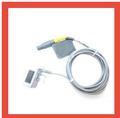
External Sidestream ETCO2 Module