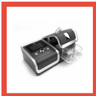
BMC Y30T Bipap Machine