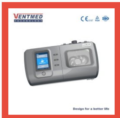
Ventmed BiPAP DS-7 & DS-8