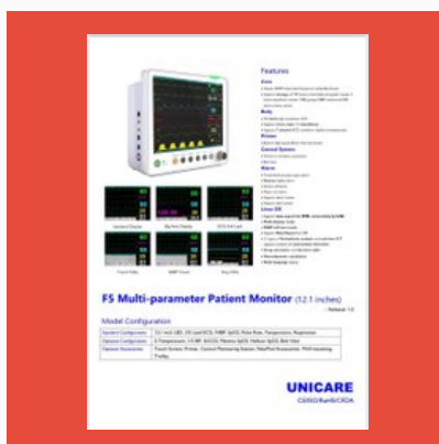
UNICARE F5 MULTIPARA MONITOR