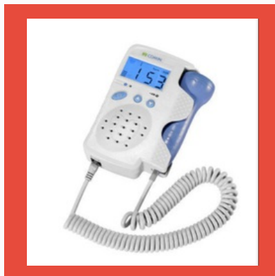
FD 200 Fetal Doppler