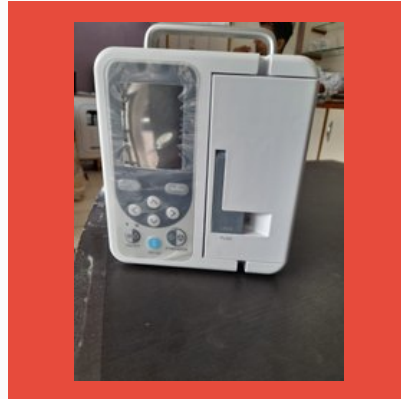
CONTEC INFUSION PUMP