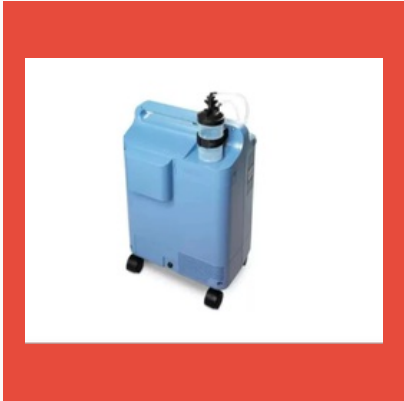
Philips Everflo Oxygen Concentrator