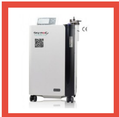
Oxymed MAOXY05 Oxygen Concentrator