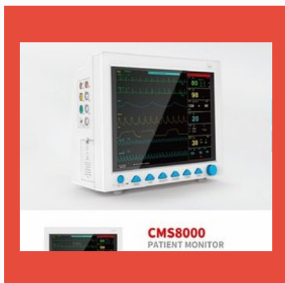
Contec Cms 8000 Multiparameter Monitor