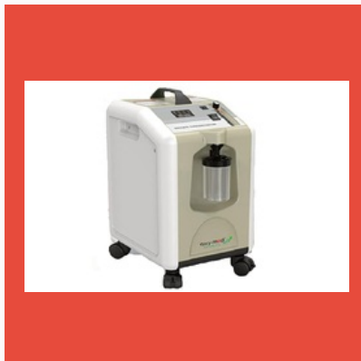
Oxymed 10 LPM Oxygen Concentrator